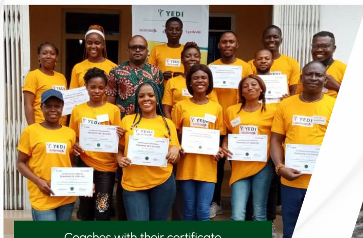
Coaches with their certificate

Through a series of rigorous training sessions and workshops, our coaches have learned valuable new techniques and strategies to improve the participants' facilitation skills, update their knowledge of Adolescent Sexual and Reproductive Health and Rights (ASRHR) including HIV/AIDS, Malaria, Monitoring & Evaluation (M&E), as well as YEDI's core values and safeguarding policies.