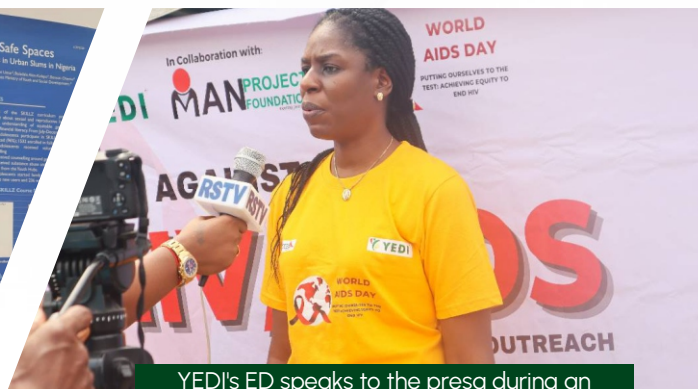
YEDI's ED speaks to the presa during an intervention activity