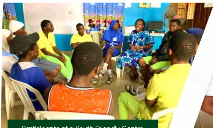
Participants at a Youth Friendly Centre