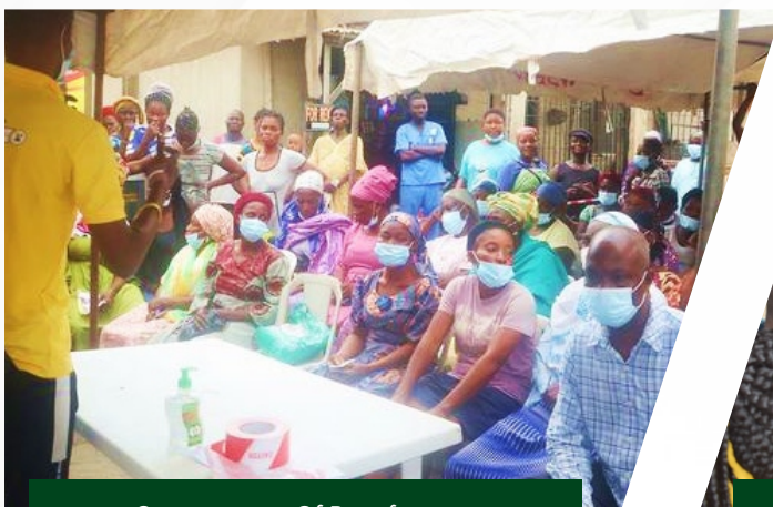
Cross section Of Beneficiaries

YEDI, in collaboration with the Lagos State Ministry of Health (LSMOH), featured in a television discussion program- Morning Delight, Talk Time Segment- aimed at sensitising the public on NTDs.