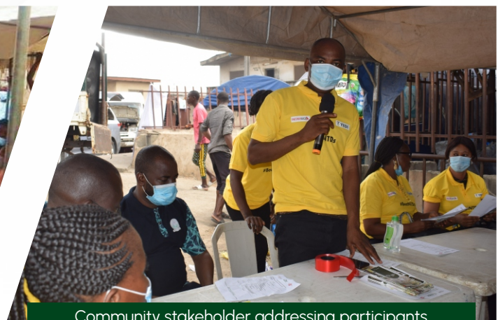
Community stakeholder addressing participants at the NTD outreach