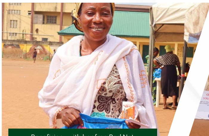
Beneficiary with her free Bed Net

We were able to make a real difference in the fight against HIV/AIDS due to the support of Grassroot Soccer, Exxon Mobil, and FIFA Foundation.