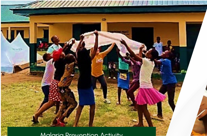
Malaria Prevention Activity