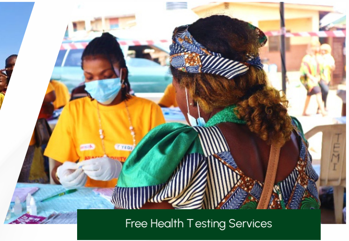
Free Health Testing Services