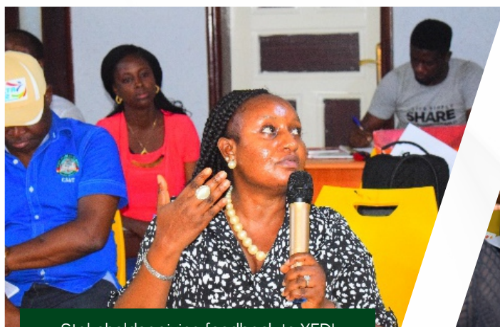
Stakeholder giving feedback to YEDI