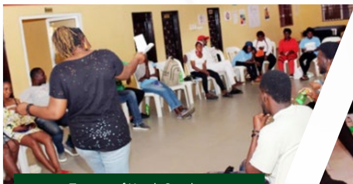
Training of Youth Coaches

Nutrition Education Training for Youth Coaches in Kano State: The Kano State Ministry of Health Nutrition team visited TEENSMATA Youth Hubs to provide nutrition training to Youth Coaches and Hub Coordinators in response to USAID's request that Nutrition also be included in the project.