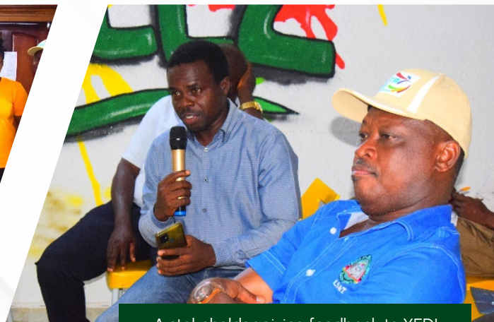
A stakeholder giving feedback to YEDI