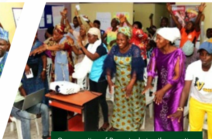
Cross section of Parents during the meeting