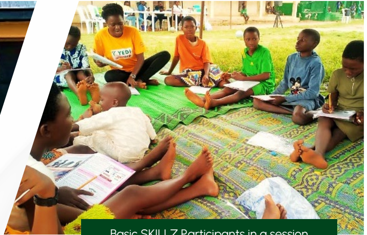
Basic SKILLZ Participants in a session