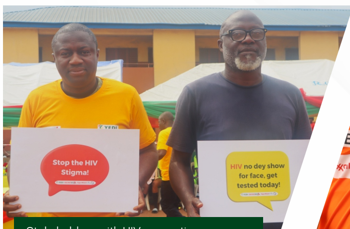
Stakeholders with HIV prevention message