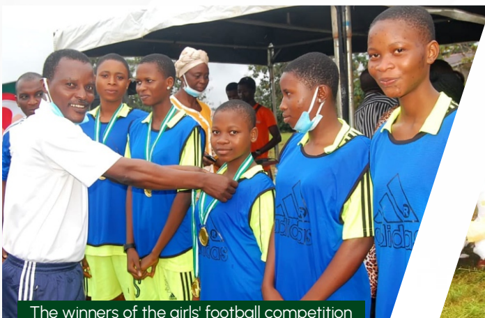
The winners of the girls' football competition receiving medals for their victory

The UNFPA-supported activity, themed "A Clean and Healthy Me", leveraged the attraction of football to educate and inspire 102 in-school adolescents aged 13 - 19 in Ogun state to overcome adolescent health and development challenges ranging from substance abuse, WASH, HIV/ Malaria, and Gender-based violence.