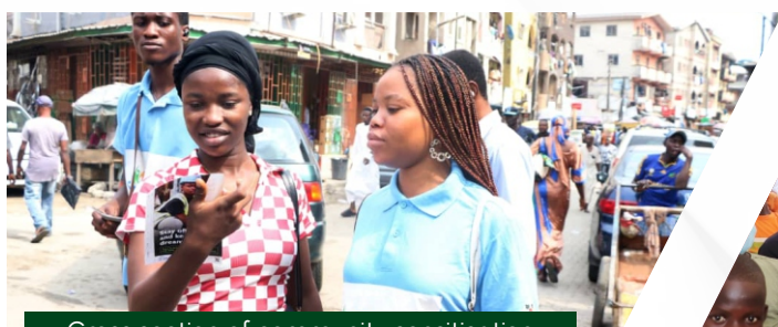
Cross section of community sensitisation

Community Sensitization targeting Husbands, Religious, and Community Leaders: A total of 3,362 community members including religious leaders were sensitised about the USAID YPE4AH TEENSMATA hub activities in both Lagos and Kano to further enhance community acceptance and increase awareness of the project.