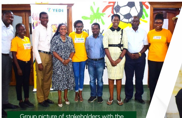
Group picture of stakeholders with the YEDI team

Overall, the stakeholders review meeting was a powerful reminder of the importance of collaboration and community engagement in creating positive change.