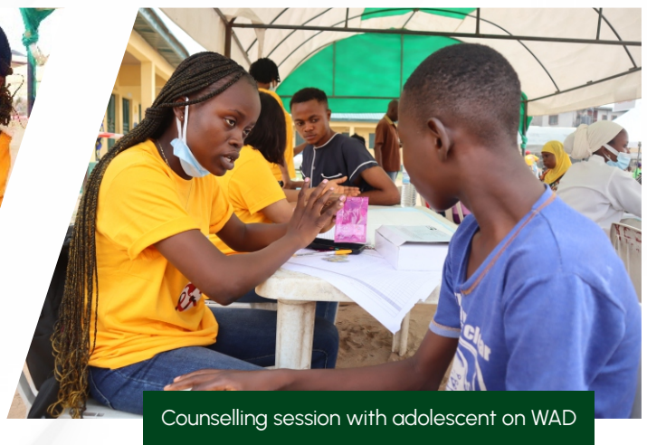
Counselling session with adolescent on WAD