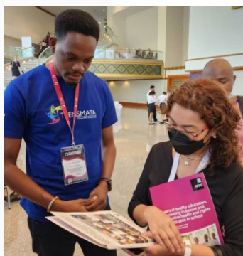
Poster Presentation at the ICFP 2022

Among over 300 applications, Grassroot Soccer and YEDI were one of Seven organisations selected to make a presentation at the Interagency Gender Working Group's Male Engagement Task Force Webinar on September 13, 2022. YEDI's presentation was titled "Engaging Adolescent Boys to Promote Reproductive Health and Prevent Gender-Based Violence in Nigeria: The SKILLZ Guyz Approach."