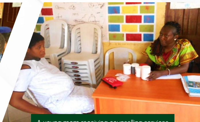
A young mom receiving counselling services