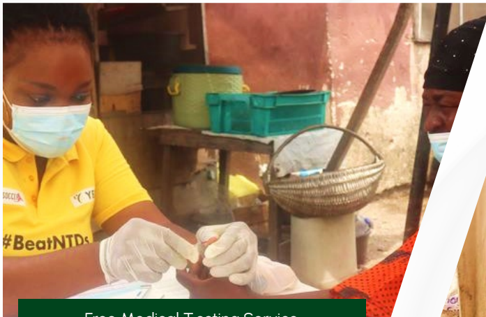
Free Medical Testing Service