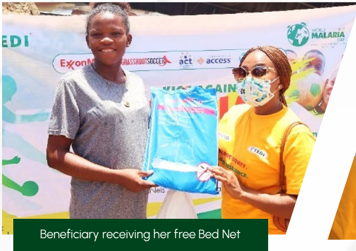
Beneficiary receiving her free Bed Net