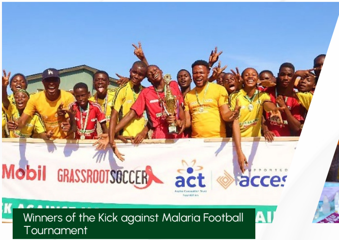
Winners of the Kick against Malaria Football Tournament