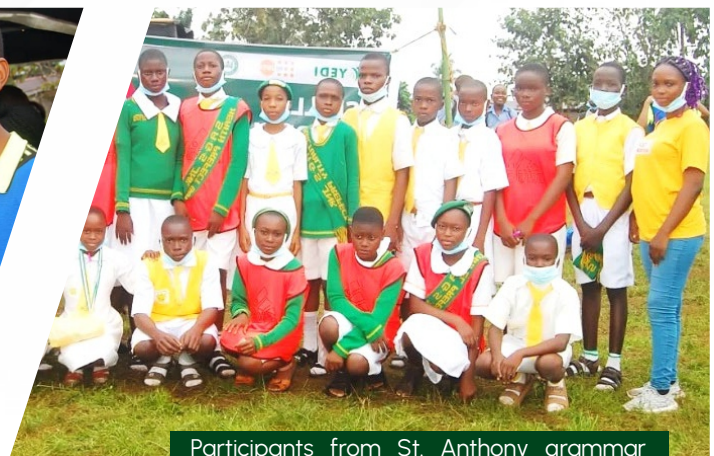
Participants from St. Anthony grammar school at the Workshop