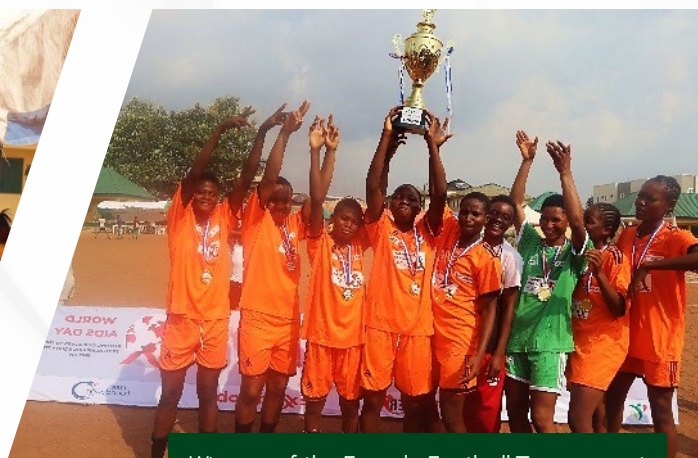
Winners of the Female Football Tournament