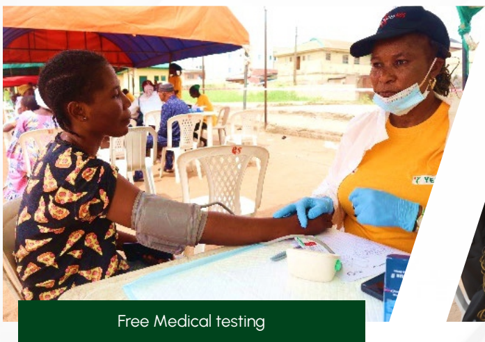
Free Medical testing

On World AIDS Day, our team came together to make a powerful statement about the importance of HIV/AIDS education, prevention, and treatment. Through our community outreach efforts, a total of 2,309 residents of identified underserved communities were reached directly with HIV testing Services (HTS) and other related services. 200 bed nets were distributed to the most vulnerable families, and condoms were also distributed. 20 of the residents tested for HIV were positive and referred for care and support.