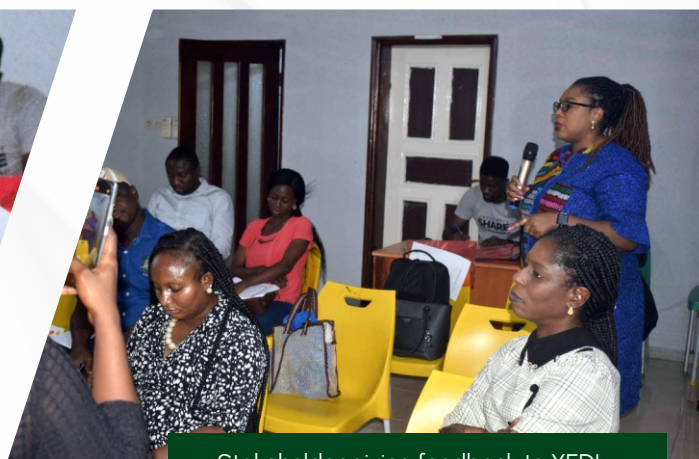
Stakeholder giving feedback to YEDI

Our annual stakeholders review meeting was a great success, bringing together a diverse group of individuals and organizations committed to creating positive change in the society. Our attendees included community leaders, parents, heads of schools, and representatives of relevant government institutions and civil society organisations, all of whom shared their unique perspectives and insights on our work. 56 stakeholders participated in the engagement meetings.