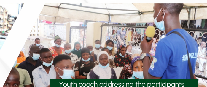
Youth coach addressing the participants during community mobile health outreach