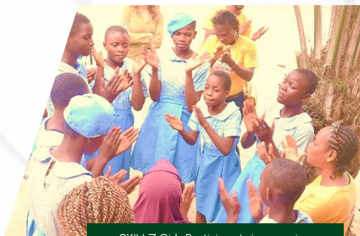
SKILLZ Girls Participants in a session