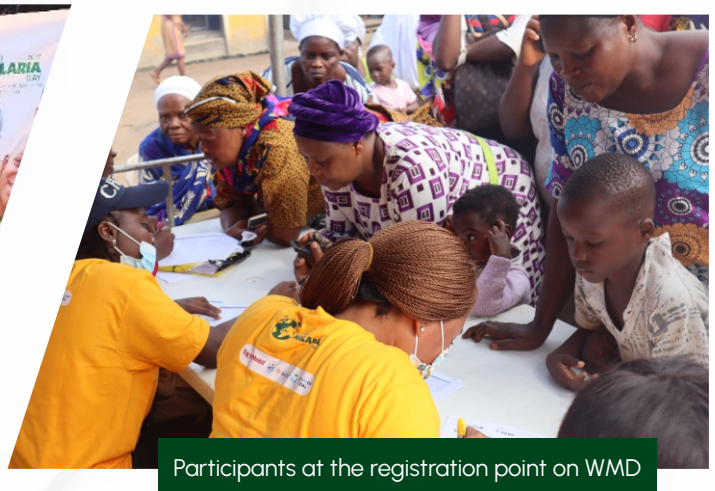
Participants at the registration point on WMD