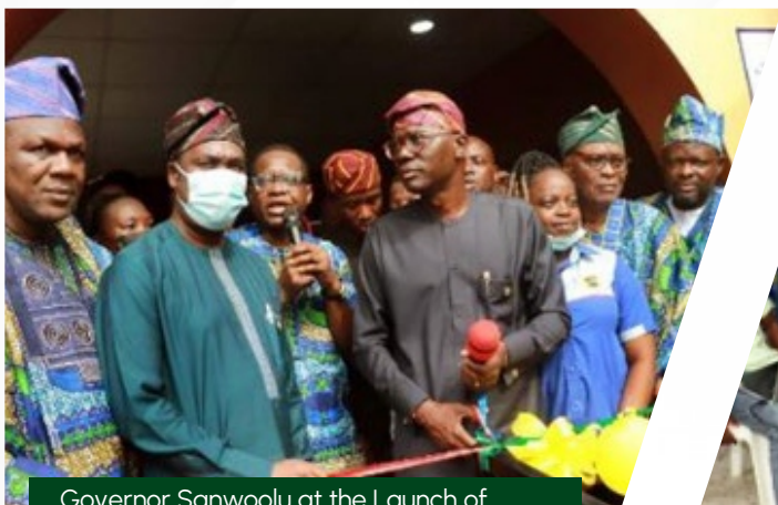
Governor Sanwoolu at the Launch of Ikorodu Hub

Parental Engagement Meeting: YPE4AH held its first parental engagement session across all the implementing LGAs and the two states. A total of 158 parents were informed about the project activities and had their capacities built on engaging their wards on SRH matters.