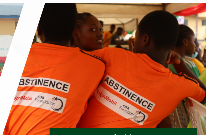
Cross section of adolescents on WAD